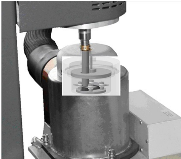
Figure 1: RheoDSC setup combining a DSC cell with heat exchanger and a rheometer